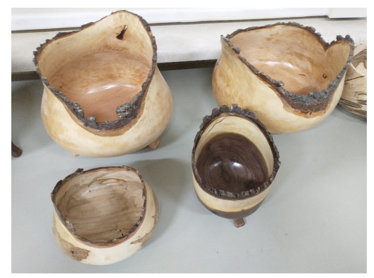
Above: A collection of Dave's footed natural-edge bowls. Three feet assures a stable base.

Right: The bottom of the bowl has been marked for the feet; the rest of it will be hollowed to a smooth curve transitioning from sidewall to rounded bottom.