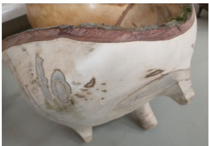
Above: The feet have been roughed-out, but the bowl has not been final-sanded yet.