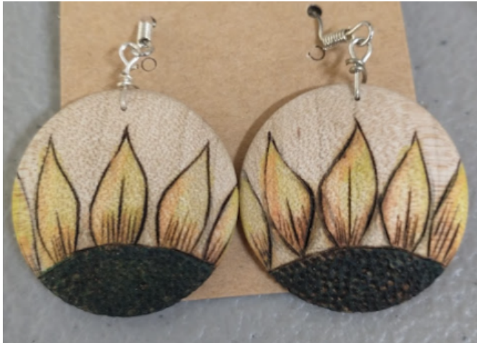
Earrings with woodburning, coloring, and stippled/burned sunflower