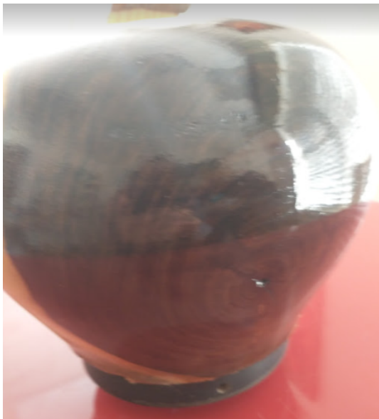
Robert Marshall turned and hollowed this face-grain walnut vessel to final thickness, then coated with thinned epoxy to minimize cracking.