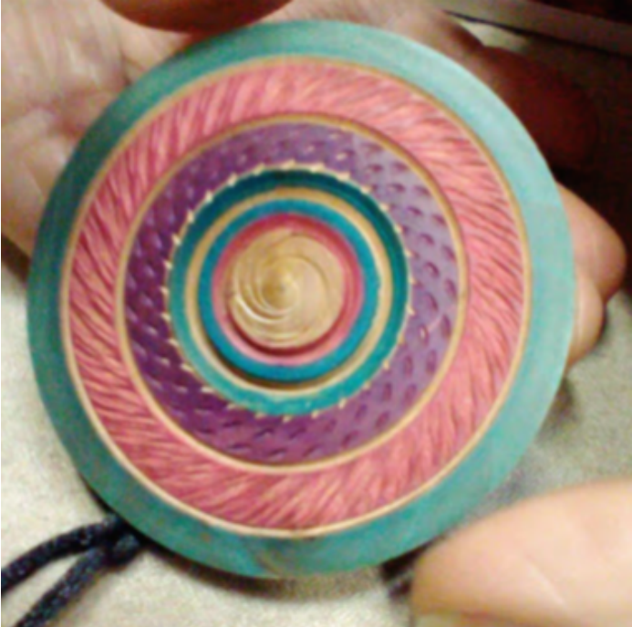
Pendant, with textured and colored surface