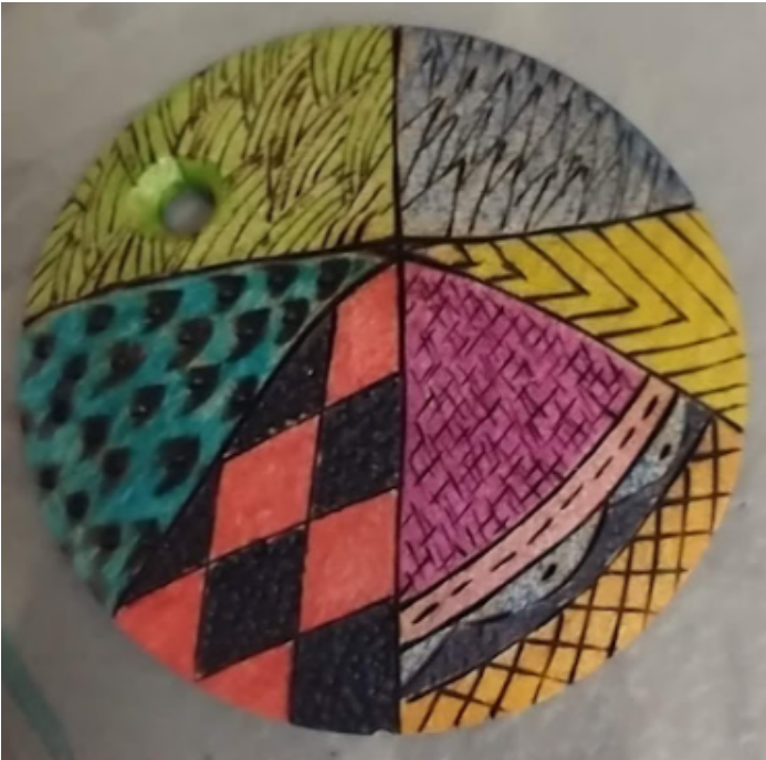
Pendant with woodburning, coloring, and a countersunk hole for the necklace