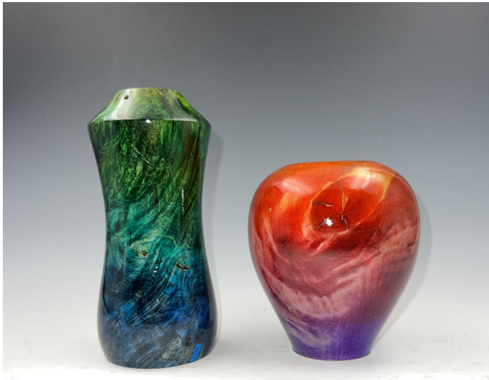
Two hollow-forms dyed during the demonstration, and then sprayed with lacquer. Note how the wood grain is highlighted by the dye treatment.