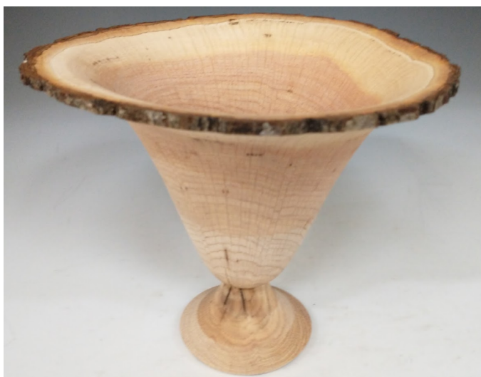
Rudy Lopez's end-grain bowl, from the February meeting; now fully dried. Having been turned end-grain orientation, there is very little warping in the drying process.