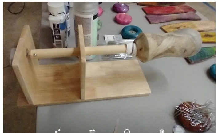
This 'slow-turner' can be used for lacquer application and drying, or for epoxy application and curing.