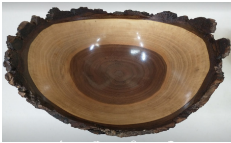
Below, walnut natural edge, also Terrence's: