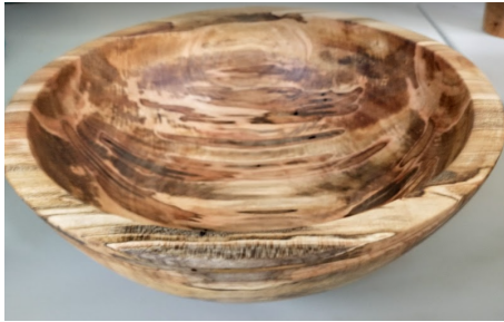
Pete Kaup' ambrosia maple bowl, above; plum vase, right.