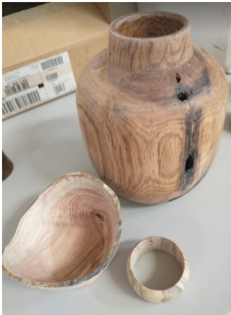
Left: Robert Marshall's black locust natural edge bowl, oak hollow-form vase, and apple bracelet; all unfinished.