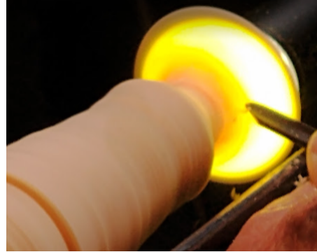
Left: carving the concave (top) side of the flower. Above: using lamp to gauge thickness, underside of flower.