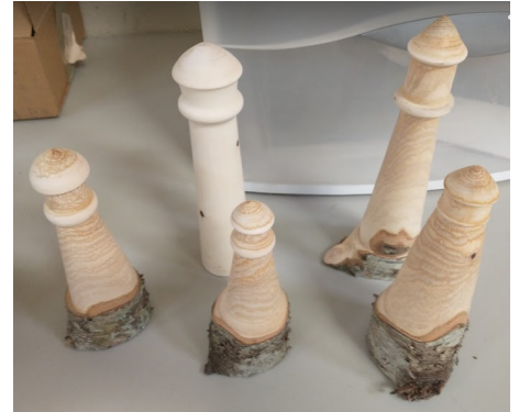
Above: a cluster of Terrence's lighthouses, from maple branches.

Challenge: bring your own flower turning or lighthouse to the September meeting.