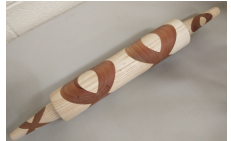
Jack Zimmerman's celtic-knot rolling pin.