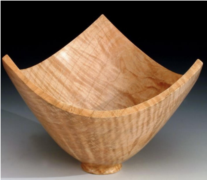
An example of a well-turned 3-point bowl.

There's a good YouTube video showing this process: ▶ Three Corner Bowl