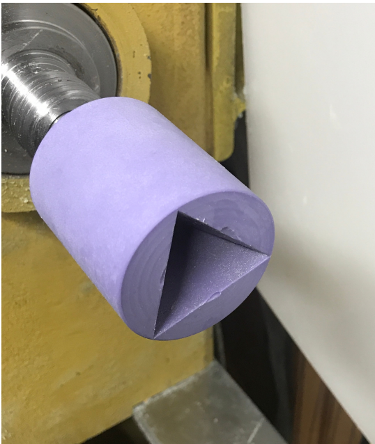
Above, Rubber Chucky cube-holder (one of a pair, for both headstock and tailstock).

Right, in the process of removing waste material from the upper side of the bowl. After this, the base of the bowl will be sawed off.