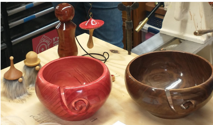
Knitting bowls, furry gnomes, pepper mill, mushroom, and a miniature knitting bowl (in back of the two large knitting bowls, mostly hidden).