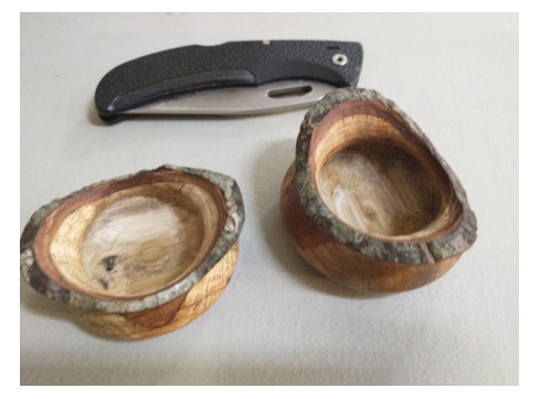
Mark Taylor turned these miniature bowls from scraps of wood. Shown with a pocket knife, for scale.