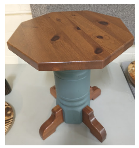
Jerry Wright built this table, with a segmented post.