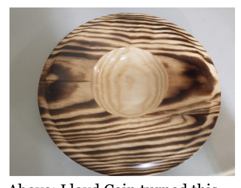
Above: Lloyd Cain turned this white pine platter, with flame embellishment. Right: This maple-padauk combo salt-pepper mill set launched Jim Smith's mill-turning streak of 10,000+.